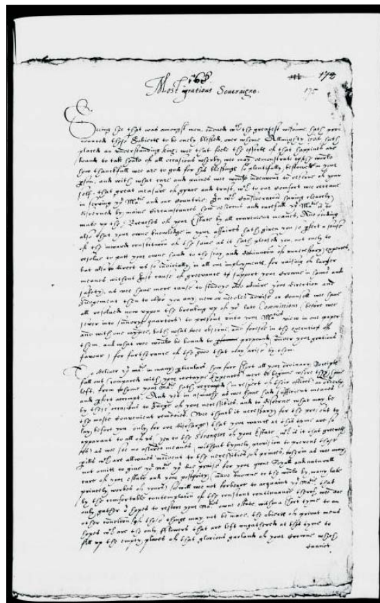
Correspondence from the Lords of Council to King James I details the finances of the Royal Treasury.